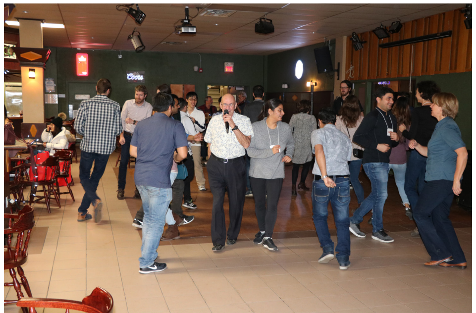
Getting warmed up for Plant Biology at the Eastern Regional Meeting

The meeting would not have run as smoothly or been as much fun without the excellent work of