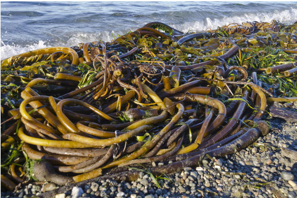
Bull whip kelp ( Nereocystis luetkeana)

Looking forward to next July, CSPB will be hosting the Plant Canada 2019 Conference in Guelph. This meeting will bring together seven societies including CSPB, the Canadian Botanical Association, Canadian Society for Horticultural Science, Canadian Weed Science Society, Canadian Association for Plant Biotechnology, Canadian Phytopathological